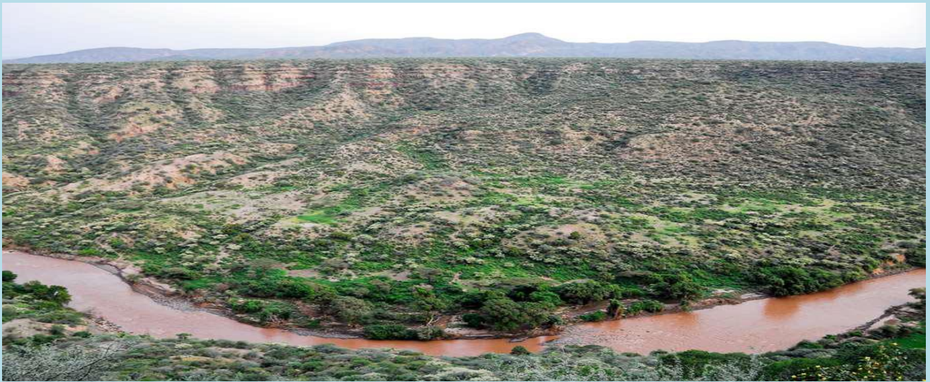
Awash National Park