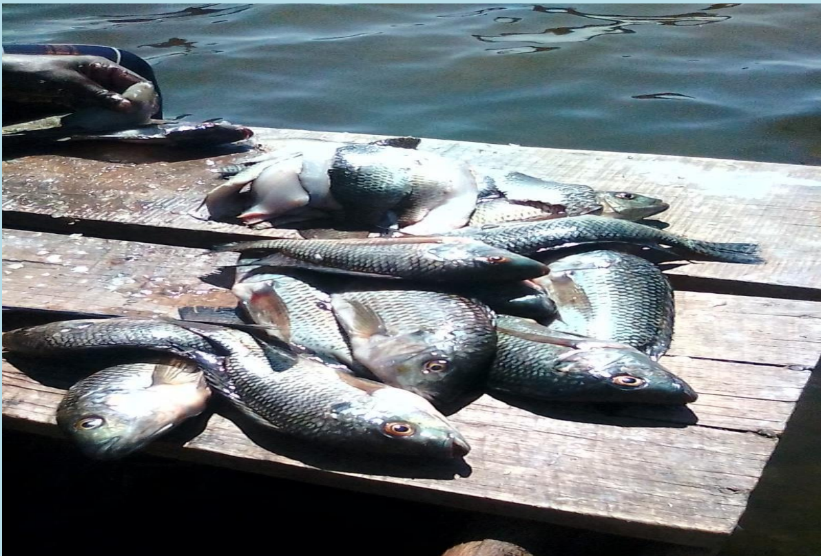
Picture 8.1 fish production