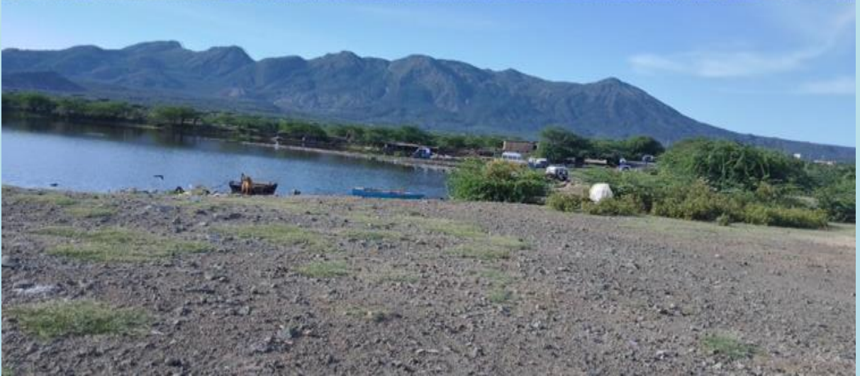
Informal green areas, open space and recreational places in Matahara town