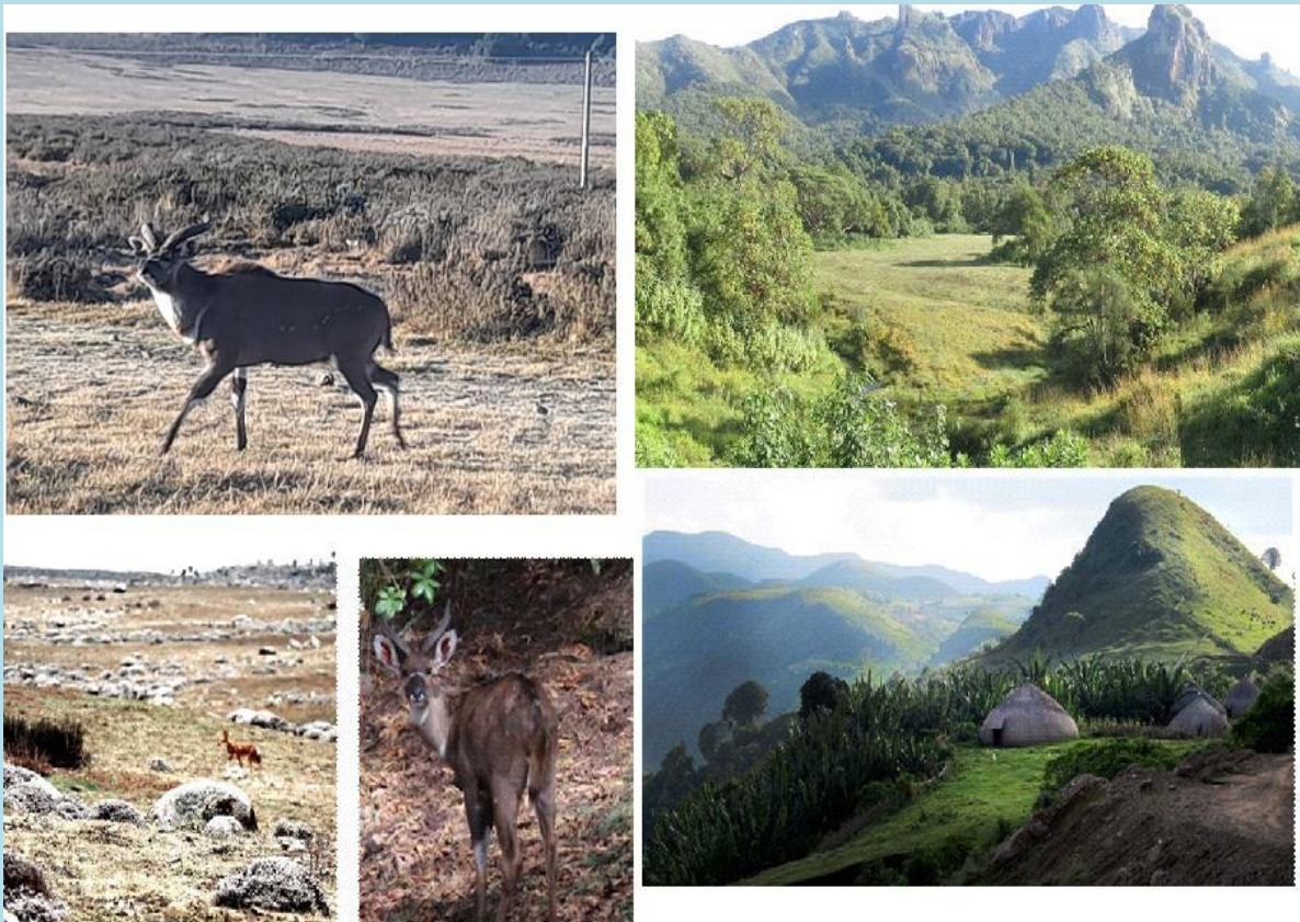
picture 8.1 The hinterland potentials of Robe major city