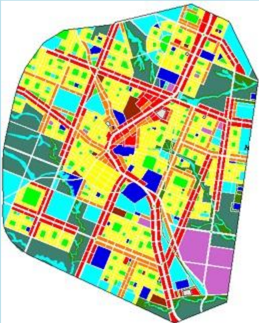
Figure 7.1: Proposed land use of the town